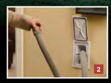
What's handier than a flexible hose that automatically stores itself?