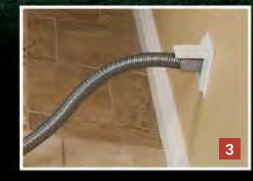
The vacuum inlets are strategically placed.