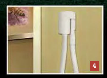
The WallyFlex : the ideal tool for a quick clean.