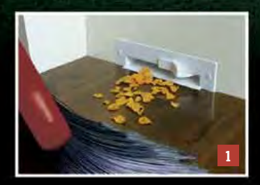
The automatic dustpan is a must for the kitchen.